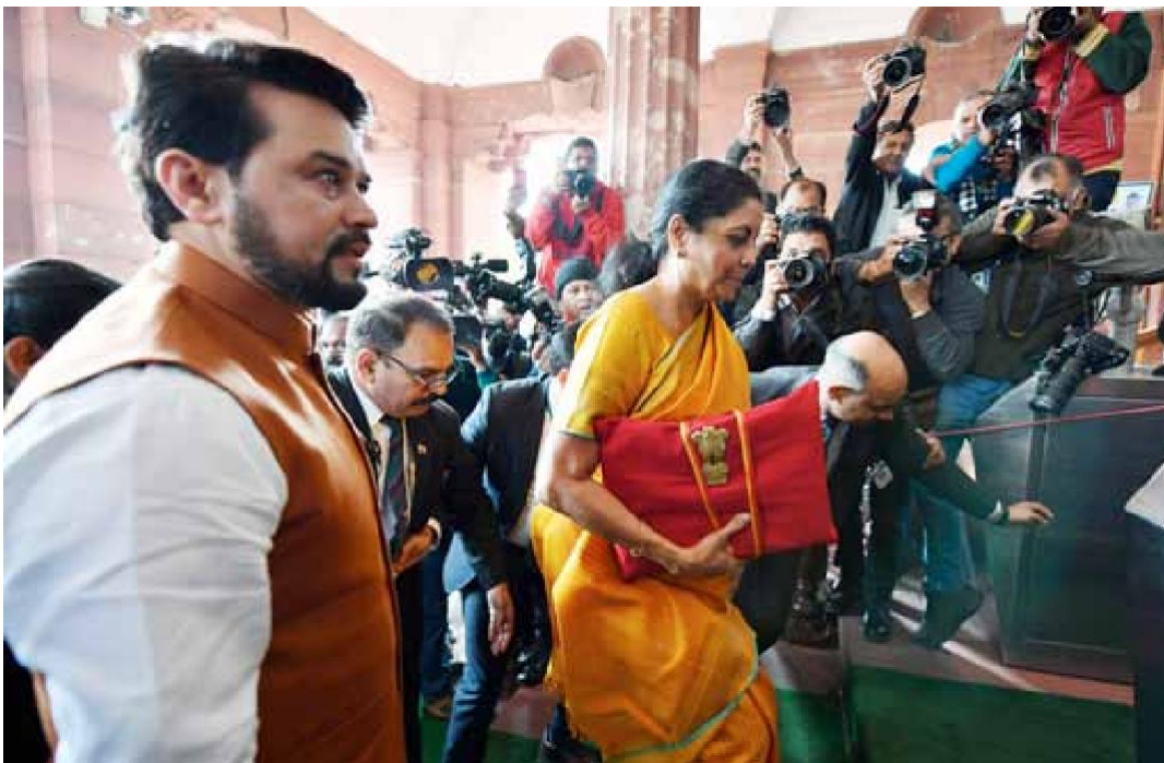
The Union Minister for Finance and Corporate Affairs, Nirmala Sitharaman, arrives at the Parliament House to present the General Budget 2020-21, in New Delhi on February 1, 2020 with Anurag Singh Thakur, Minister of State for Finance and Corporate Affairs

One of the successes of macroeconomic management since 2014 has been control of inflation. Inflation is a regressive tax. It hurts the poor relatively more than it hurts the relatively rich. Six per cent real growth and four per cent inflation yield 10 per cent nominal growth, while six per cent real growth and nine per