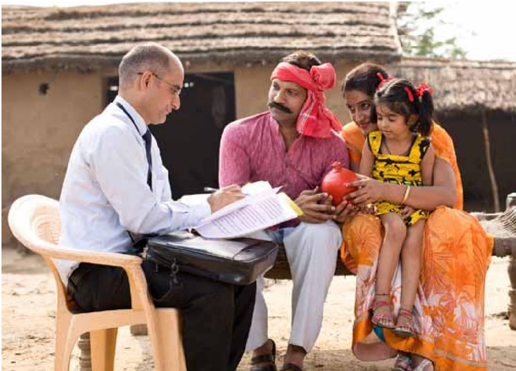
Rural economy constitutes 46% of national income and it is imperative that widespread growth and development are inclusive of rural and small scale economy

using what is known as SECC (Socio-Economic Caste Census). This survey is used to identify beneficiaries, both for Union and state-level schemes, eliminating leakage and multiplicity. Subsidies are now channelled into bank accounts and linked to Aadhaar (Aadhaar is an identification number issued by the Unique Identification Authority of India to every resident of the country). Productivity gains